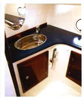
A smart toilet compartment

Engine options & access Useful range of diesel options and tidy installations ✓✓✓✓✓