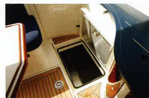
Lazarette storage in the cockpit

The hardtop gives excellent protection and while the roof can be kept open in all but the