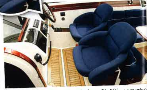
Decent bucket seats at the helm, with lifting squabs