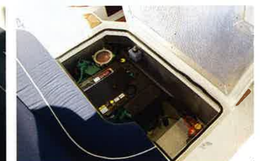
The engine hatch exposes the main service points