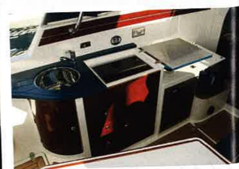
A full working galley is situated in the cockpit