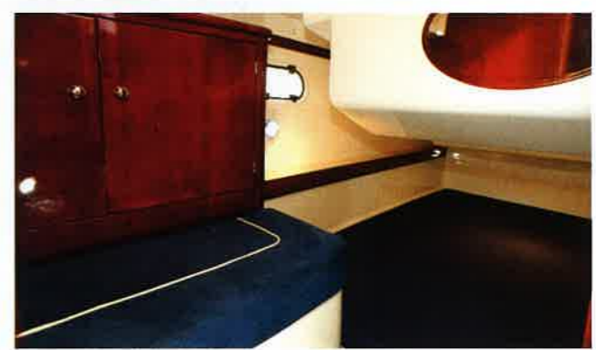
The midships cabin has its own door, standing headroom and a seat