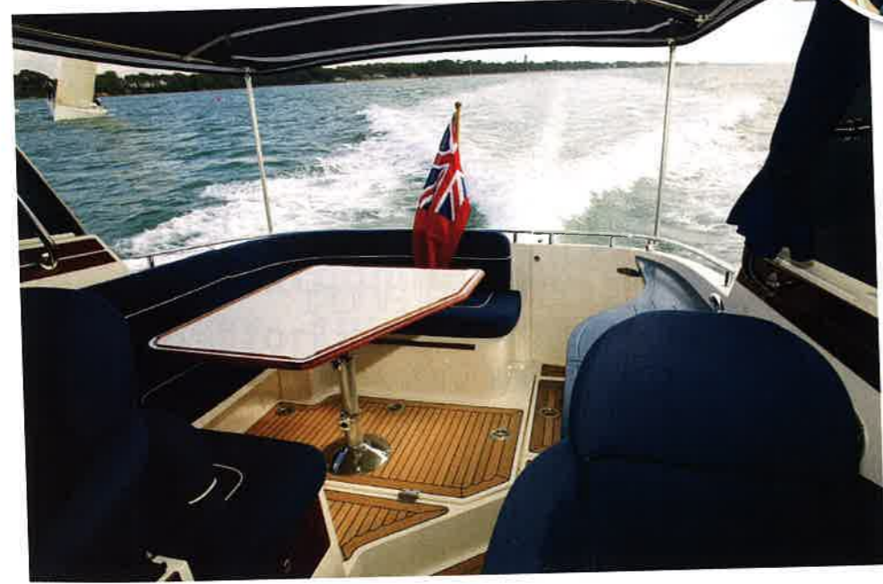
The good-sized dinette is protected by a simple but effective pull-out canopy

just below the 6ft (1.83m) mark. Stowage is as good as space permits with lined storage bins under the seat cushions, a hanging locker, a further cupboard or two and proper fiddled shelving outboard. The dinette converts to a sizeable double, or given that the seat bases are a good width – 2ft (60cm) – they could work as a pair of V-shaped singles.