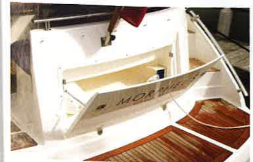
A handy transom boot for fenders

Access to the main engine check points is fine although the hefty cockpit table needs removing from its pedestal before the deck hatch can be lifted; some minor modifications here might allow it to rise up without having to fiddle with the table. In fact, the hatch only bears the forward part of the compartment and for more major servicing the rear seat base needs to be unscrewed and removed, but it is less of a problem given items like the water strainer and