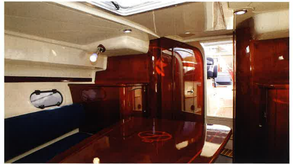
Whether you're after sleep or social time, the warmth of the cherry joinery is incredibly inviting down below